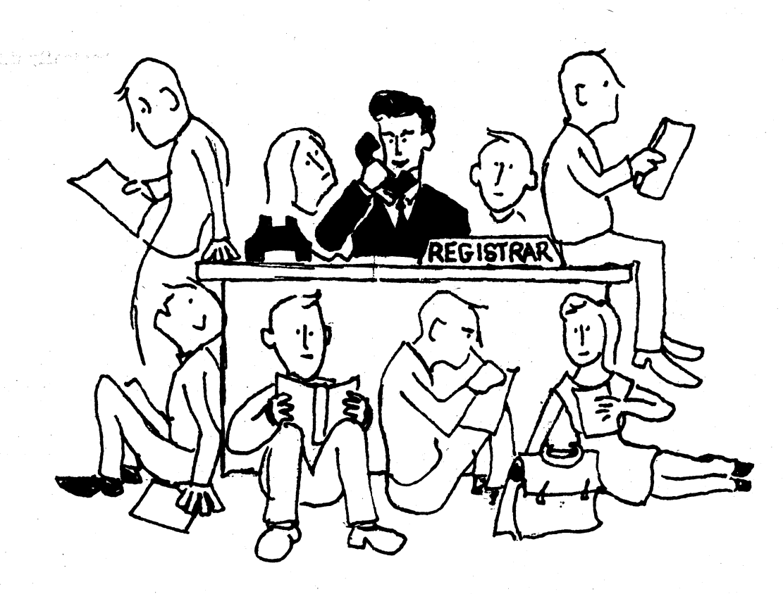
" Yes, I think we can squeeze in another student - how small is he?"

GLENDON NEXT YEAR? - reprinted from the University of Winnipeg's Uniter