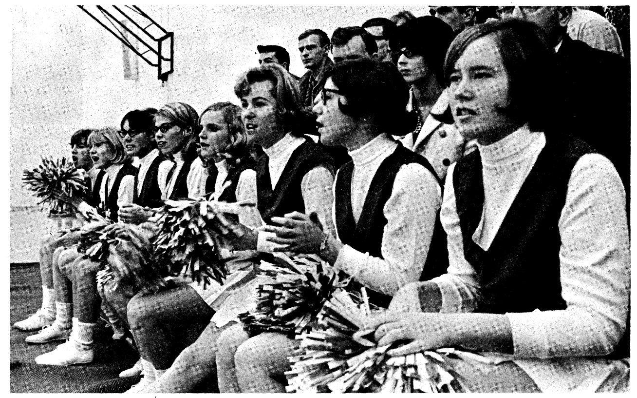
Those "nasty" cheerleaders and their pom-poms; But we love 'em.

of above Choices FREE DELIVERY On Any Order of $2.75 or Over UNDER $2.75 . . . 50c CHARGE