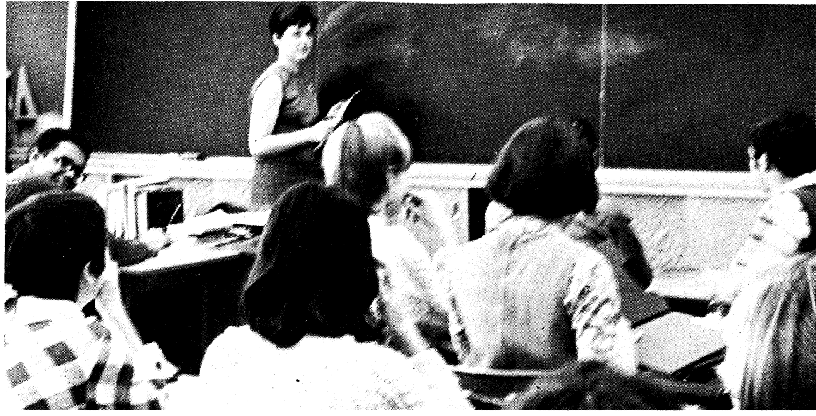
The OUS teach-in on Saturday will discuss tlze higlz sc/zool system.

A mass meeting is planned for Sunday at 1:00 at UniversityCollege at U of T to discuss what action students can take in Toronto high schools.