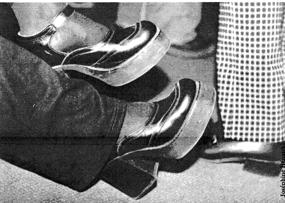
Today's styles are nothing but a pale copy of the originals, according to our fashion expert..

society, seem to be stagnating. We're losing our originality, running out of fresh new ideas. So, we do the next best thing: we turn back to tried-andtrue methods, to what was popular before, to come up with the innovations we're lacking. And these are just the fashions and clothes I'm talking about. Then of course, there is the huge sector that almost absolutely