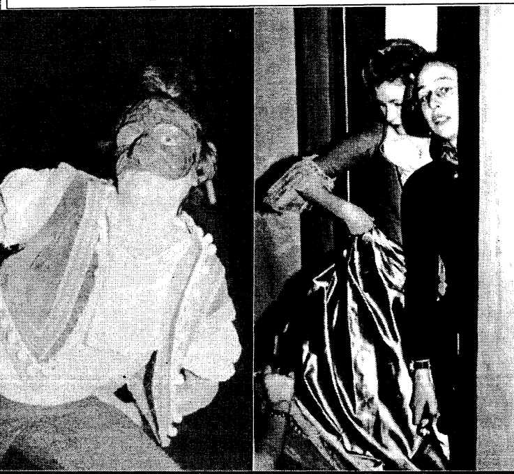
The cast from DON JUAN is ready to perform. The play continues until March 28. Don't miss it!