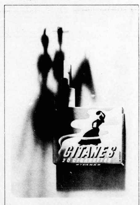
Cigarettes and Cigarette Tobacco