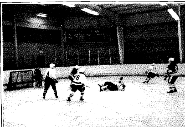
The Maple-Lys in action.

Ce qui semblait être la suite du film "Slap Shot" en début de saison, aura moins l'allure d'un vrai rigodon rendu au 9 avril. La magie du club aura été un peu moins essouffée et beaucoup plus facile à avaler. Pas de chicane de famille, un réaménagement dans la structure stratégique des plans de match, des performances moins infructueuses ont tous collaborés à élever la qualité du jeu des Maple-Lys cette année - on se verra aux éliminatoires!