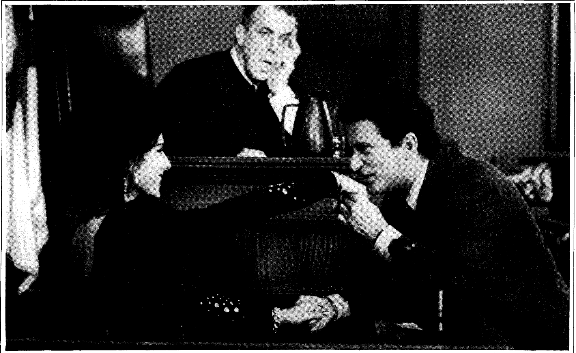
Inexperienced defence lawyer Vincent needs all the help he can get to win his case, and he gets it from his fiery fiancée Lisa.