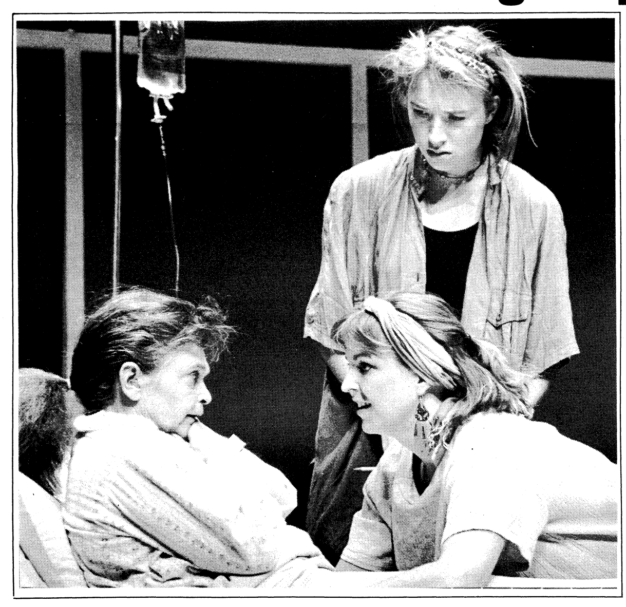
The Factory Theatre production of White Weddings explores relationships between mother and daughters.