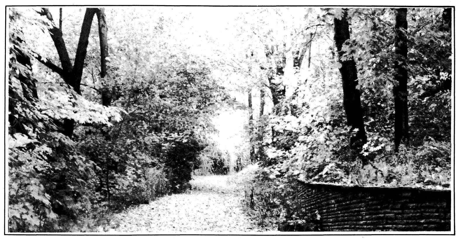
Compared to today, this photo of the early seventies, shows how the path behind Wood Residence has slowly lost its natural aspect.

Students and staff may have noticed bricks lying around on campus. People have been dumping bricks on the lower campus and this is being cleaned